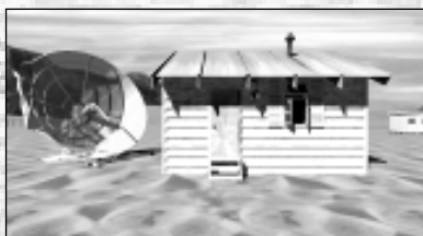
Davenport's office (outside view)

As you exit Davenport's office, turn left and proceed to the warehouse at the far end of the road. As you move the hand pointer over the doorknob, you'll notice the keys from your inventory appear in your hand. Click the keys on the doorknob. You will enter the warehouse.