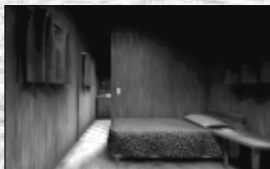
Inside Your Quarters

This concludes the sample walk-through. You have achieved the following in this short section of the game: