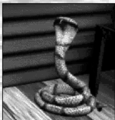
Beware of Cobra!

While exploring a bit you'll find a scorpion and a cobra. DO NOT touch them! Instead, walk to the back of the hut where you will find Chris performing some kind of ritual. If you disturb him, he'll make it clear that he doesn't appreciate being bothered. Click on the statue next to the storage locker. Chris will tell you about it. Exit the Quonset hut.