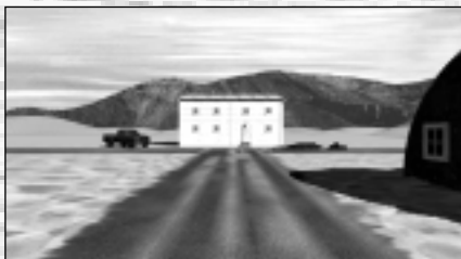
Warehouse (outside view)

As soon as you step outside, Davenport will approach you. While he doesn't have anything useful to tell you at this time, the topic of his conversation does give you some insight into his character. Proceed forward and turn right to face the trailers. Go to the first trailer on the right and enter it.