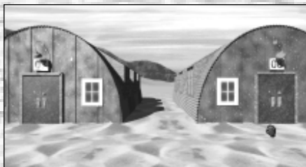
Quonset Hut 8

That's about all you can do for now. If you want to sleep (and really, that's the only way to get to the next part of your adventure), return to the trailers and make sure to enter the one assigned to you: the second one on the left).