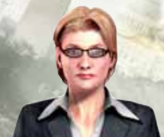
President Patricia Caldwell

Businessman Lucius Galliard has a successful, diversified portfolio. He also has powerful friends – friends who have made him the point man in an explosive operation that threatens to shake the foundations of Washington. With private military company Black Arrow following his orders, Galliard is a man to be reckoned with.